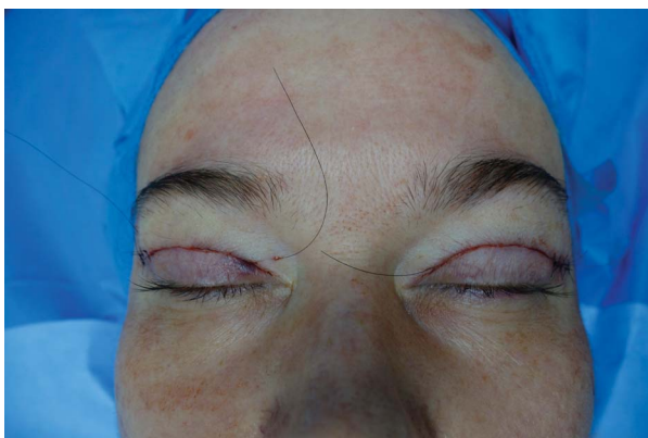
Figure 2. External intradermal suturing (the right upper eyelid) versus internal intradermal suturing (the left upper eyelid) after upper blepharoplasty.

The difference between the medial and the lateral sides of the upper eyelid skin, and also the other sites of wound closure, could be explained by either thinness of the skin at the medial canthus and thereby rapid wound healing, in combination with ingrowth of epidermal cells along the suture thread. This difference can also be explained by the fact that the suture always